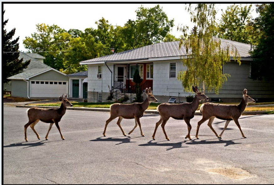
Urban Mule Deer

Refuge staff are also in the midst of revising the Refuge's 7 th -grade environmental education program in partnership with the Caldwell School District. Friends have supported this effort by providing stipends for participating teachers who will collaborate with Refuge staff in a workshop to revise the program for maximum impact with all students (of which 60% are Hispanic/Latino), and to inspire continued engagement with the Refuge.