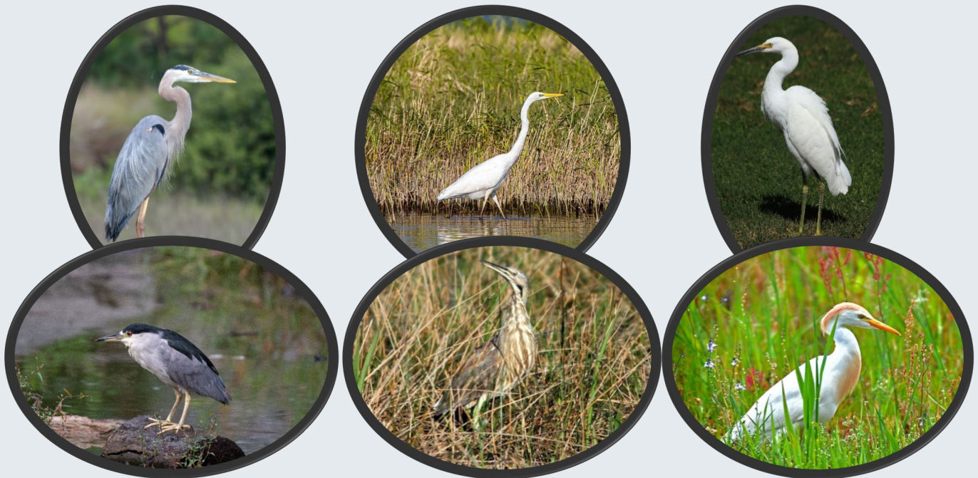
Top: Great Blue Heron, Great Egret, Snowy Egret Bottom: Black-crowned Night Heron, American Bittern, Cattle Egret (all photos are stock images)

Of lesser abundance, and even rarely, one might catch a glimpse of a solitary American Bittern in a clump of cattails or a flock of wandering Cattle Egrets (non-natives) feeding in an adjacent field.