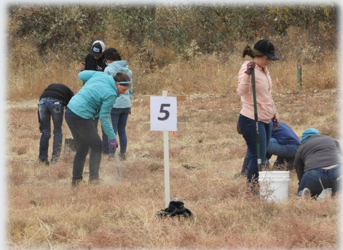
Shrub Planting October 2021

The Friends group will furnish drinks and snacks during the planting fun. Some extra shovels and gloves will also be available.