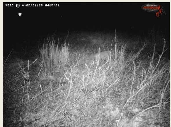
Figure 7: Mystery Critter - Any guesses?