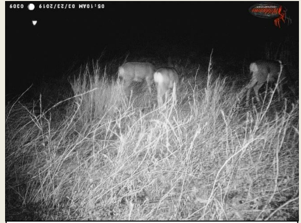
Figure 3: Deer family grazing through