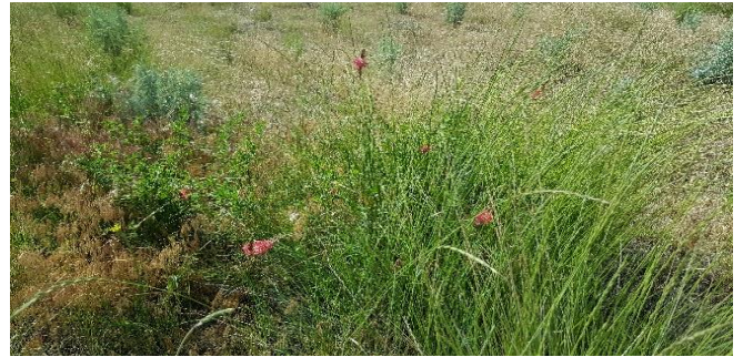
Plot 1- Sagebrush, bunchgrass, milkvetch & cheatgrass 5/31/19

The mild winter, along with ample spring moisture, has been a boon for the native shrubs and forbs planted in our restoration plots east of the Refuge visitor center. The sagebrush and saltbush in the three-acre Plot 1 (which was planted in November of 2017, then hand-watered and weeded during the 2018 growing season) are very robust, and the bunch grass that was seeded in October 2016 is coming in with greater abundance.