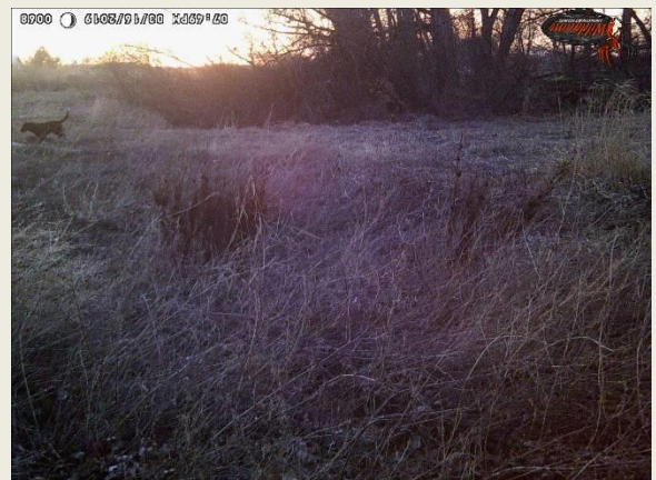
Figure 5: Dog at dusk