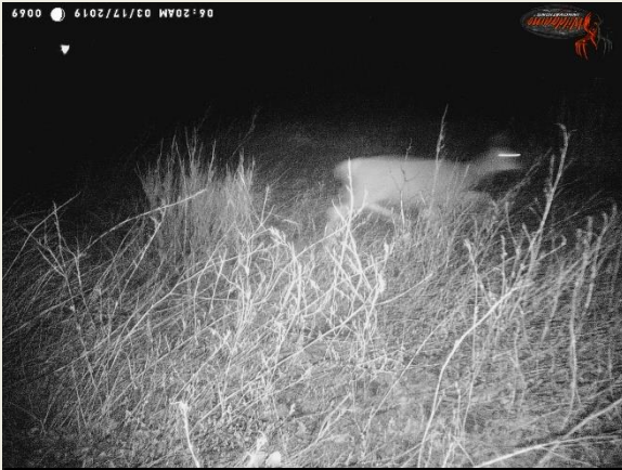
Figure 2: First photo-capture of a deer