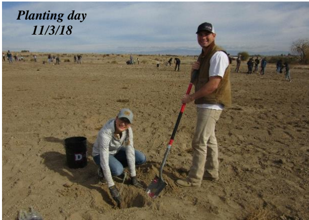
Planting day 11/3/18

In Plot 2 (about two acres), the shrubs and forbs, which were put in the ground in November 2018, are also growing with vigor. But, alas! The wet spring has also over-favored weedy vegetation, such as cheatgrass, wild mustard, and peppergrass. These undesirable species have outgrown and overshadowed the preferred shrubs and forbs, even though there was a concentrated effort to weed around them on Earth Day, April 20.