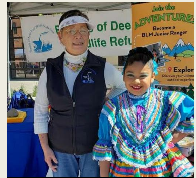
"Dia de los Ninos"

Through these types of activities, Board members have reached out to thousands of children and adults, securing new Friends memberships, Refuge volunteers, and family participation at Refuge events and programs.