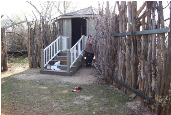
Original pole fencing used to screen approaching viewers from wildlife.