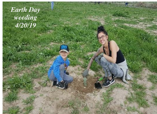
Earth Day weeding 4/20/19

So, anyone who likes to garden is welcome to come out and help us uncover sage and forbs hiding among the forest of weeds. You might even find some surprises under the weed canopy, like wild onions, yellow fiddlenecks, lavender daisies, white penstemon, and blue flax.