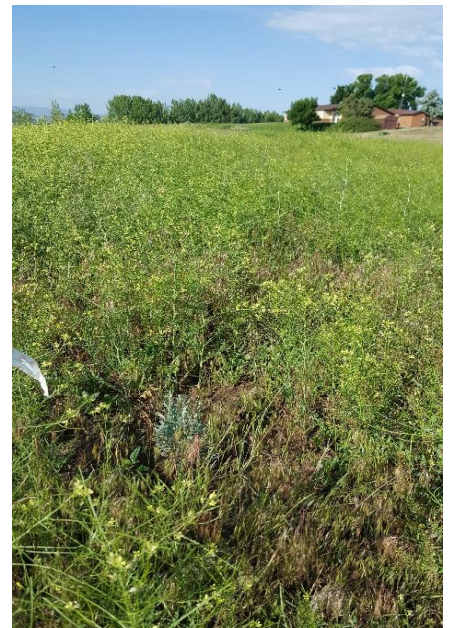
Field of mustard over- shadowing sagebrush 5/31/19