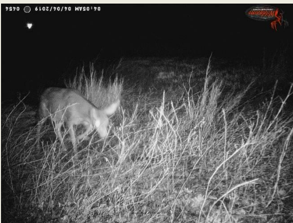
Figure 4: Coming close in