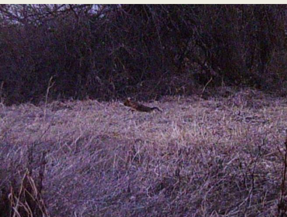
Figure 6: Feral Cat