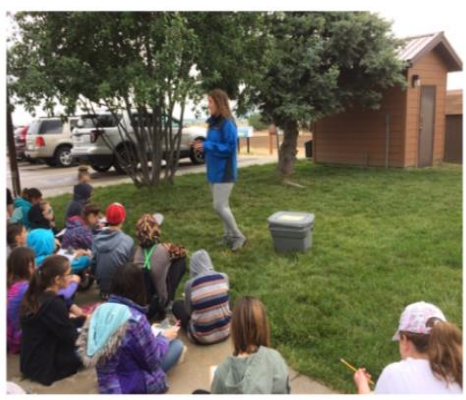
Lake Ridge Elementary students learning about animal tracks in "Track Your Neighbors" science module. Study area near Refuge Visitor Center, May 17, 2018.

The Friends of Deer Flat Refuge aided several school field trips by awarding bus scholarships to the Refuge this spring. The "Discover Wildlife Journeys (DWJ)" program involved four elementary schools from the Caldwell/Nampa area. These programs allowed fourth and fifth graders the opportunity to experience the Refuge, some for the first time.